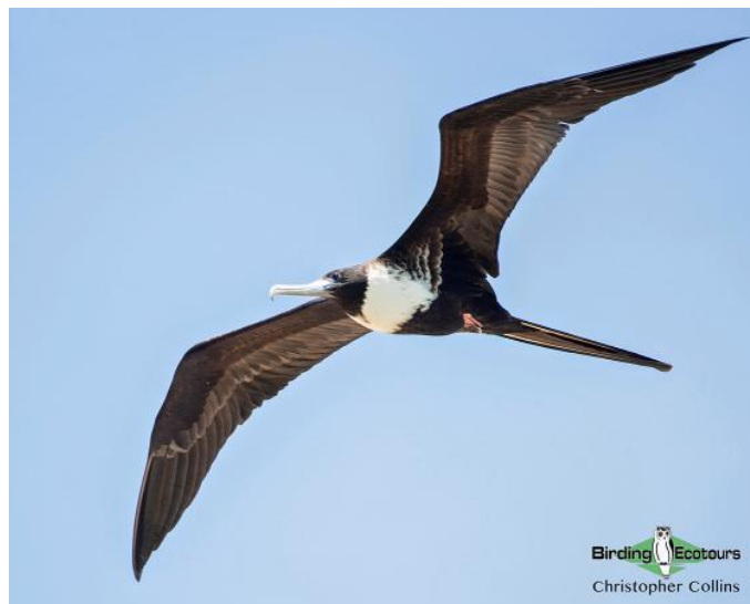
Magnificent Frigatebird female

Magnificent Frigatebird Fregata magnificens – First seen at Fort De Soto Park and then many seen in the Dry Tortugas, which harbors the only breeding colony of this species in the United States. Many hung in the breeze above Fort Jefferson.