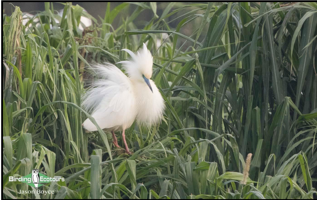
A Malagasy Pond Heron in breeding plumage

This pre-pre-tour to our Best of Madagascar: 14-day Birding and Wildlife Tour can also be booked as a stand-alone tour. It can also be combined with our following 6-day Masoala Peninsula Pre-tour and, following the main tour, with our 6-day Berenty Reserve Extension .