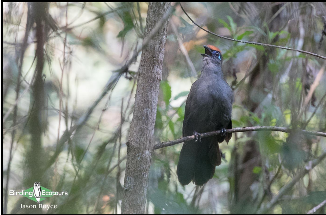
Red-capped Coua can be seen in the Ankarafantsika area.